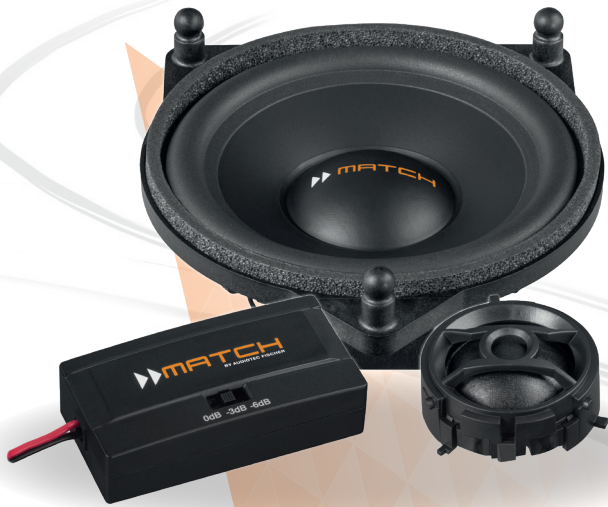
» Front / Rear* 2-way compo