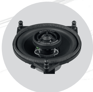
» Front / Rear 2-way coax