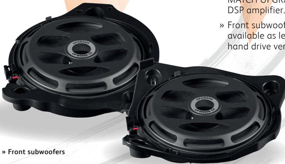
» Front subwoofers